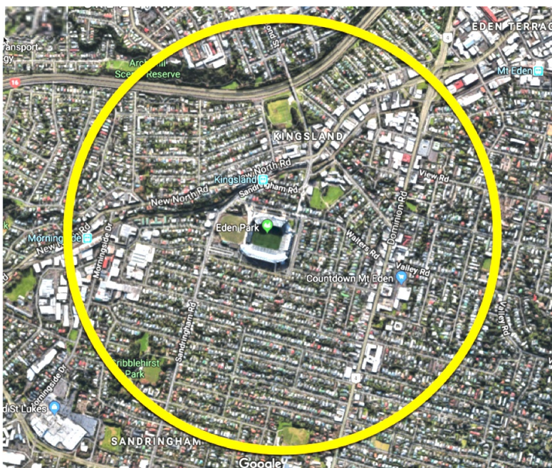
Eden Park - 1Km = 4000 dwellings

At 1 km from the speakers Mt Smart has only 93 houses - we have 4000